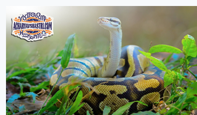
Seeing Snake in Dreams? Here is the Astrological Interpretation for You only!