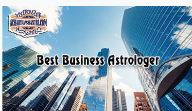
Best Business Astrologer