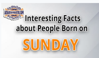
Interesting Facts about People Born on SUNDAY Personality Traits of People Born on Sunday