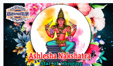
Ashlesha Nakshatra - Star of clinging