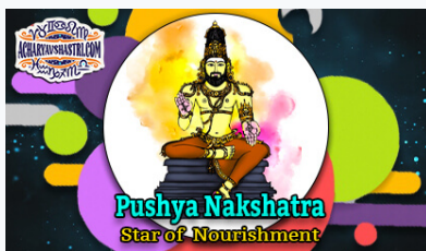
Pushya Nakshatra - Star of Nourishment