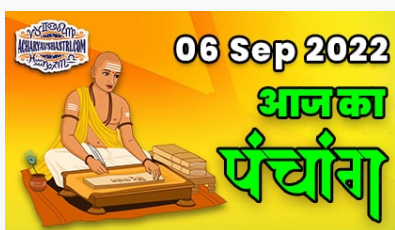
06 Sep 2022 आज का पंचांग Aaj Ka Panchang 06 सितंबर 2022 का पंचांग: 06 September 2022 ka Panchang, शुभ मुहूर्त और राहुकाल का समय, Best Muhurat