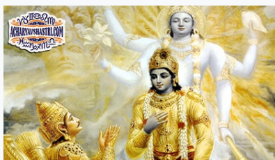
Bhagwad Gita the essence of life