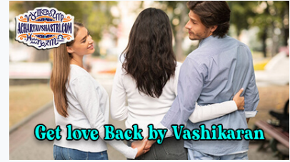
Get love Back by Vashikaran