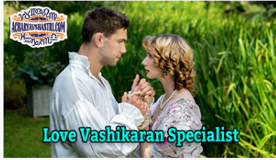
Love Vashikaran Specialist