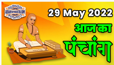
Aaj Ka Panchang 29 मई 2022 का पंचांग: 29 May 2022 ka Panchang, शुभ मुहूर्त और राहुकाल का समय