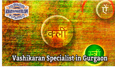
Vashikaran Specialist in Gurgaon