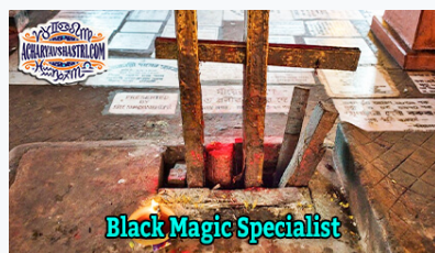
Black Magic Specialist