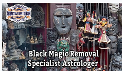
Black Magic Removal Specialist Astrologer