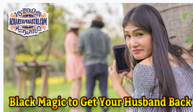
Black Magic to Get Your Husband Back