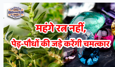
महंगे रत्न नहीं, पेड़-पौधों की जड़े करेंगी चमत्कार | Relation between Plants and Planets in Astrology