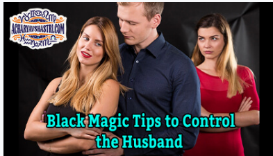
Black Magic Tips to Control the Husband