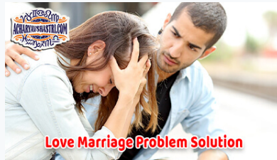
Love Marriage Problem Solution