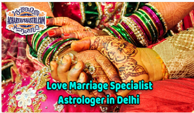
Love Marriage Specialist Astrologer in Delhi