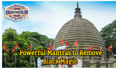
Powerful Mantras to Remove Black Magic