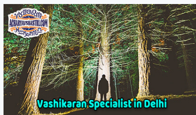
Vashikaran Specialist in Delhi