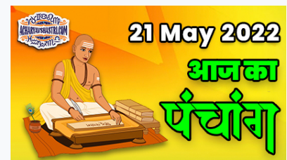
Aaj Ka Panchang 21 मई 2022 का पंचांग: 21 May 2022 ka Panchang, शुभ मुहूर्त और राहुकाल का समय