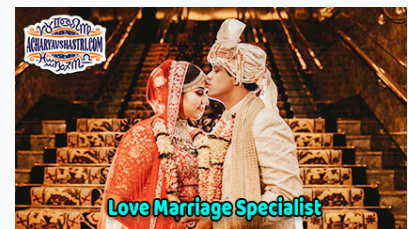
Love Marriage Specialist