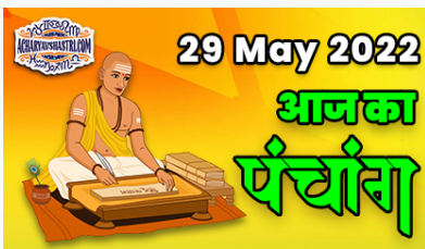
Aaj Ka Panchang 29 मई 2022 का पंचांग: 29 May 2022 ka Panchang, शुभ मुहूर्त और राहुकाल का समय