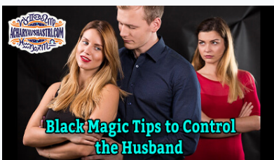
Black Magic Tips to Control the Husband