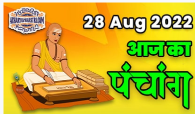
Aaj Ka Panchang 28 अगस्त 2022 का पंचांग: 28 August 2022 ka Panchang, शुभ मुहूर्त और राहुकाल का समय