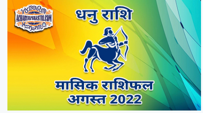
धनु मासिक राशिफल अगस्त 2022 हिंदी में | Sagittarius Monthly Horoscope August 2022 in Hindi