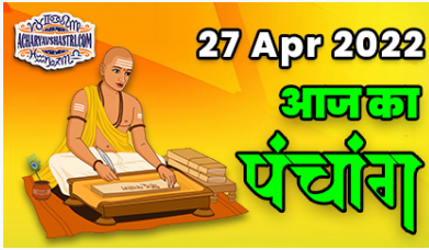
Aaj Ka Panchang 27 अप्रैल 2022 का पंचांग: 27 April 2022 ka Panchang, शुभ मुहूर्त और राहुकाल का समय