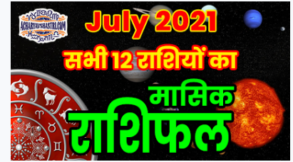
July Masik Rashifal- Monthly Horoscope