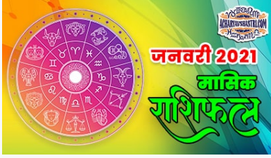
12 Rashi Masik Rashifal Jan 2021