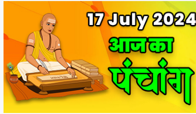
Aaj Ka Panchang 17 जुलाई 2024 का पंचांग: 17 July 2024 ka Panchang, शुभ मुहूर्त और राहुकाल का समय, Best Muhurat