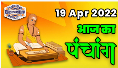
Aaj Ka Panchang 19 अप्रैल 2022 का पंचांग: 19 April 2022 ka Panchang, शुभ मुहूर्त और राहुकाल का समय