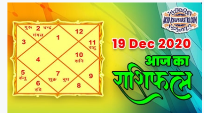
19 Dec AAJ KA RASHIFAL | आज का राशिफल | मेष से मीन